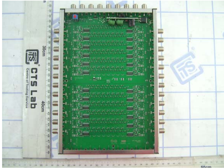
Figure 7 (Internal view -2)

Type Designation: MULTISWITCH, TMS9/24 S Report Number: CGZ3141231-04410-L