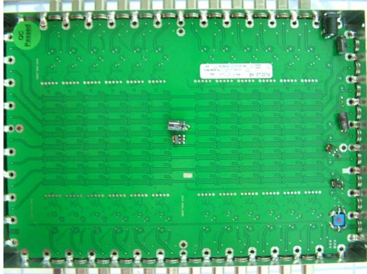
Figure 9 (PCB-side 2)

Type Designation: MULTISWITCH, TMS9/24 S Report Number: CGZ3141231-04410-L